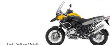
Light Yellow Metallic