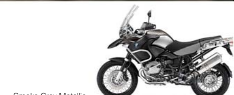
Smoke Grey Metallic